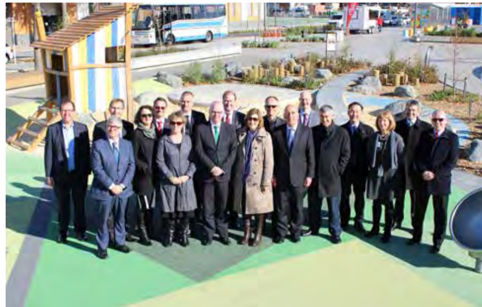
The leaders of various government departments and agencies, with a role in the regeneration of greater Christchurch, recently took the opportunity to see progress first-hand and meet and build relationships with local leaders.

"While the role may be changing, the Government is in it for the long haul when it comes to helping New Zealand's second-largest city bounce back and fulfil its potential."