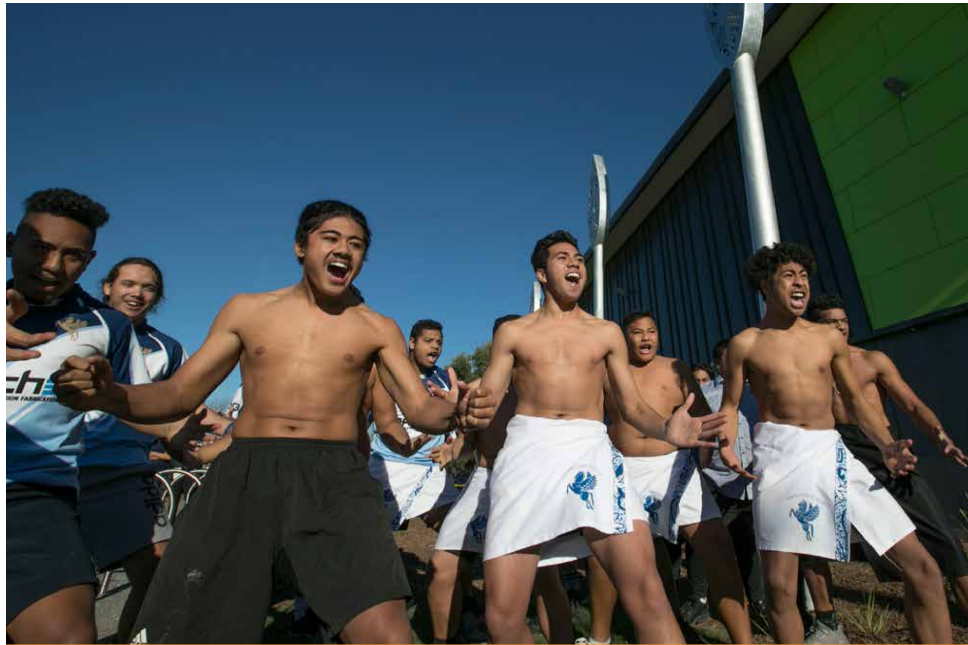
Aranui High School Academy performing a haka at the opening of the Aranui Wainoni Community Centre.