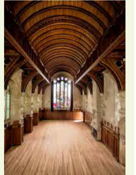
The Arts Centre's beautifully restored Great Hall is open to the public later this month.

For the first time since the earthquakes, the community is being welcomed back to the Arts Centre's Great Hall for two open days later this month.