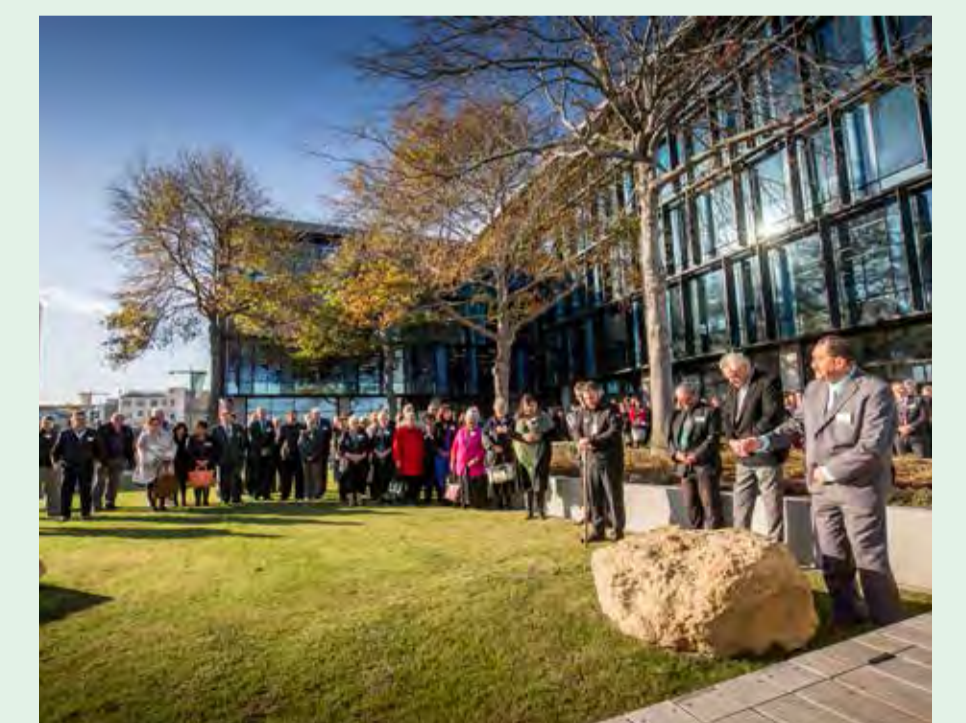
Blessing of the kōhatu mauri by representatives from five of Canterbury's ten Rūnanga, in front of the new Environment Canterbury building at its official opening last month.