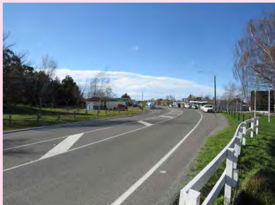
The draft Malvern Area Plans propose looking at opportunities to provide more housing options near Darfield's centre, and completing a town centre study of issues like transport, beautification and business land.

Selwyn District Council is inviting submissions on draft Area Plans for Malvern and Ellesmere.