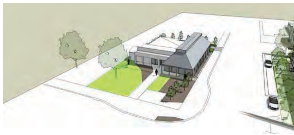
Eastern view of the planned new building.