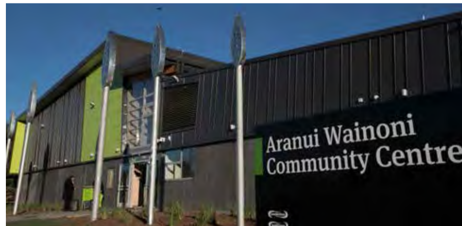
The purpose-built facility has separate changing rooms for sports teams, indoor and outdoor stages, meeting rooms, office space and a large kitchen.

A rousing haka by local high school students has marked the opening of the new Aranui Wainoni Community Centre.