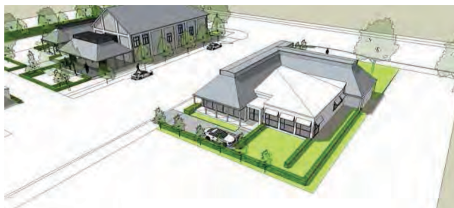
North-facing windows will provide good, natural reading light.