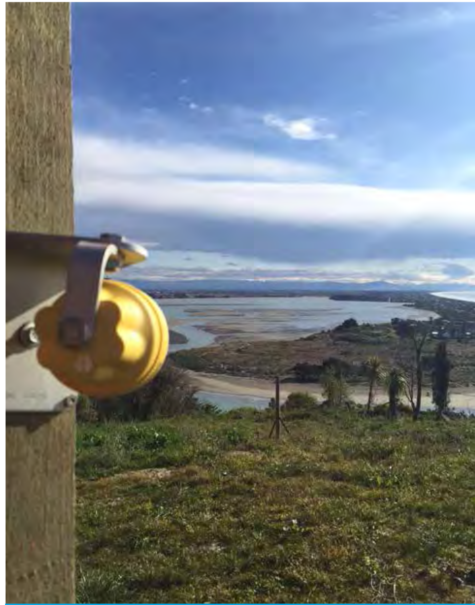
A series of prisms encased in weather-proof housing (foreground) monitor ground movement from Deans Head. The LINZ monitoring container is located on Reserve Spit, Southshore (opposite).

Land Information New Zealand (LINZ) inherited Canterbury Earthquake Recovery Authority's responsibilities for clearing Crown-owned properties, and the maintenance of Crown-owned land, in the residential red zones.