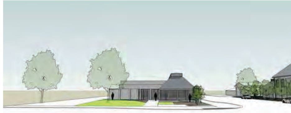
Artist's impression. The Oxford Service Centre and Library building as viewed from Main Street, Rangiora.