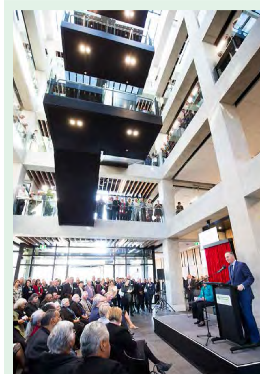
Staff gathered around the central atrium under the floating stairwell at the official opening of the new Environment Canterbury headquarters by Prime Minister John Key in May.