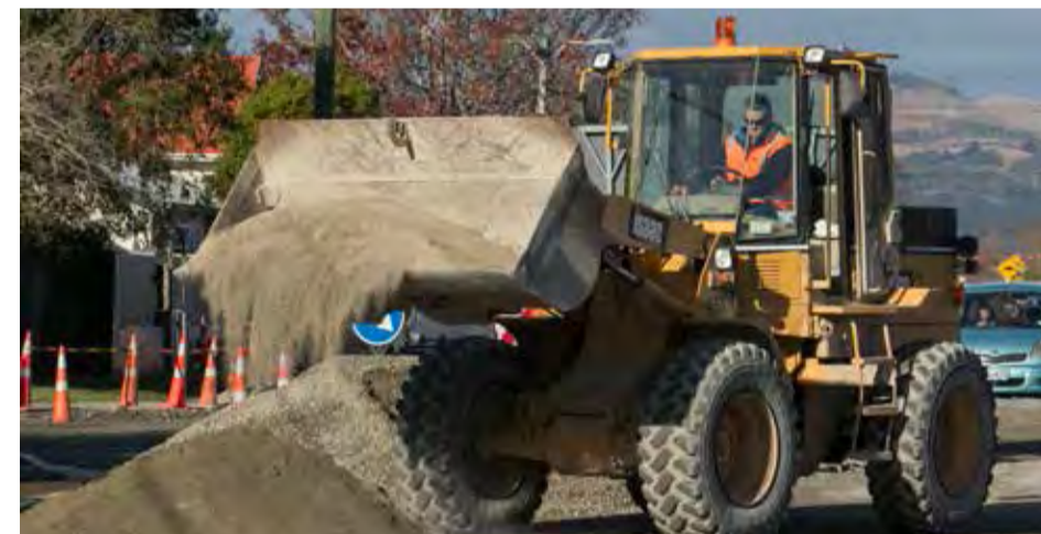
Making progress on the road repair and surfacing of Petrie Street, between Shirley Road and Warden Street.

The road resurfacing work will address earthquake-damaged roads not funded through the SCIRT programme of work, as well as roads where patch repairs remain following SCIRT work on underground pipes and resealing is required. ■