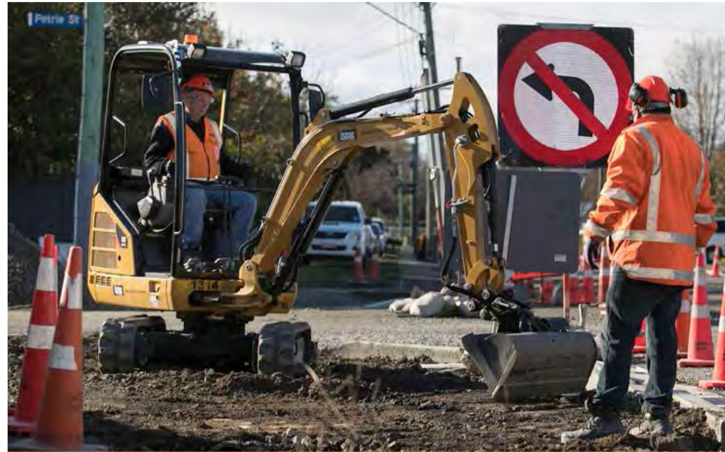
Contractors dig out the footpath as part of the Petrie Street repairs in Richmond.