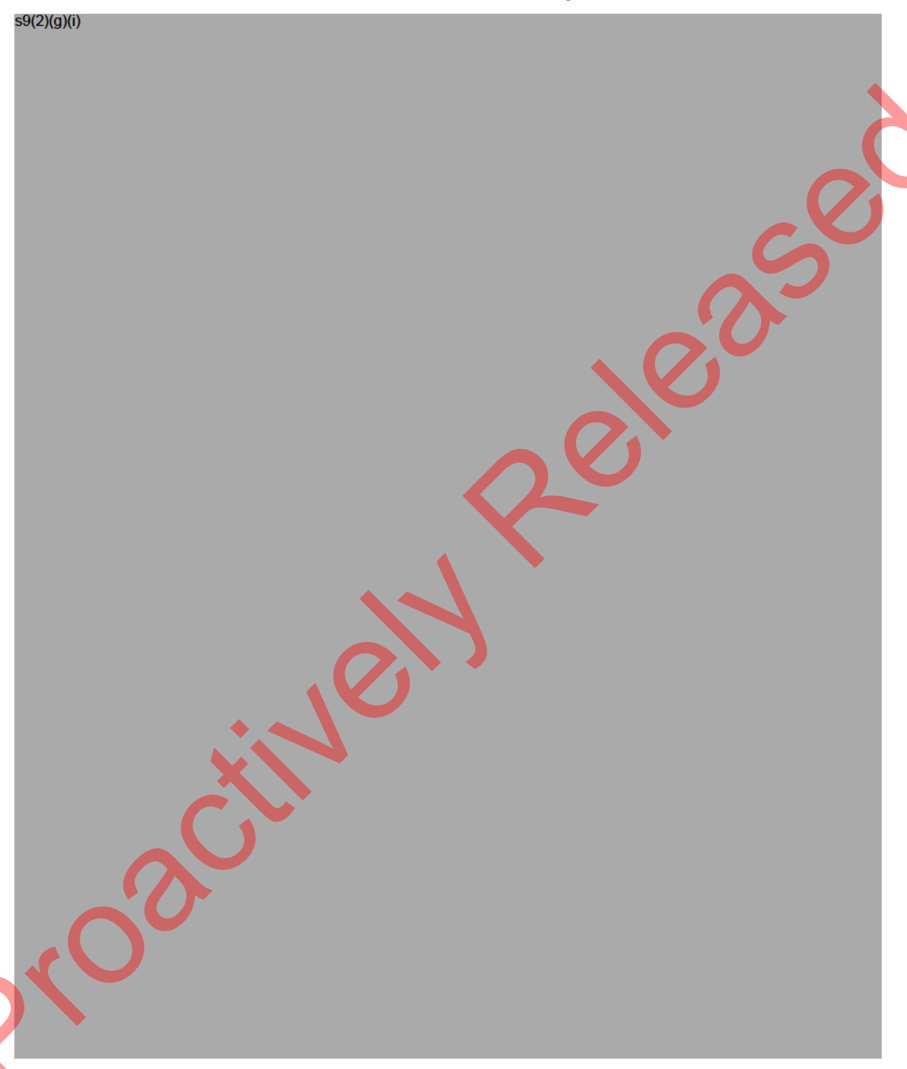
Table 1: Report-backs and readiness activities asked of agencies

15. As part of readiness assurance, we will provide you with updates on progress through the COVID-19 weekly report (see Attachment 1 for an example of the reporting).